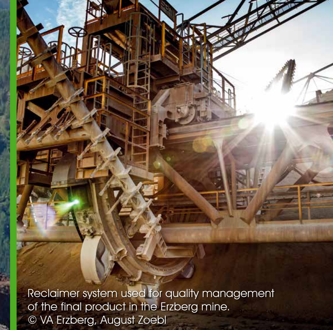
Reclaimer system used for quality management of the final product in the Erzberg mine.