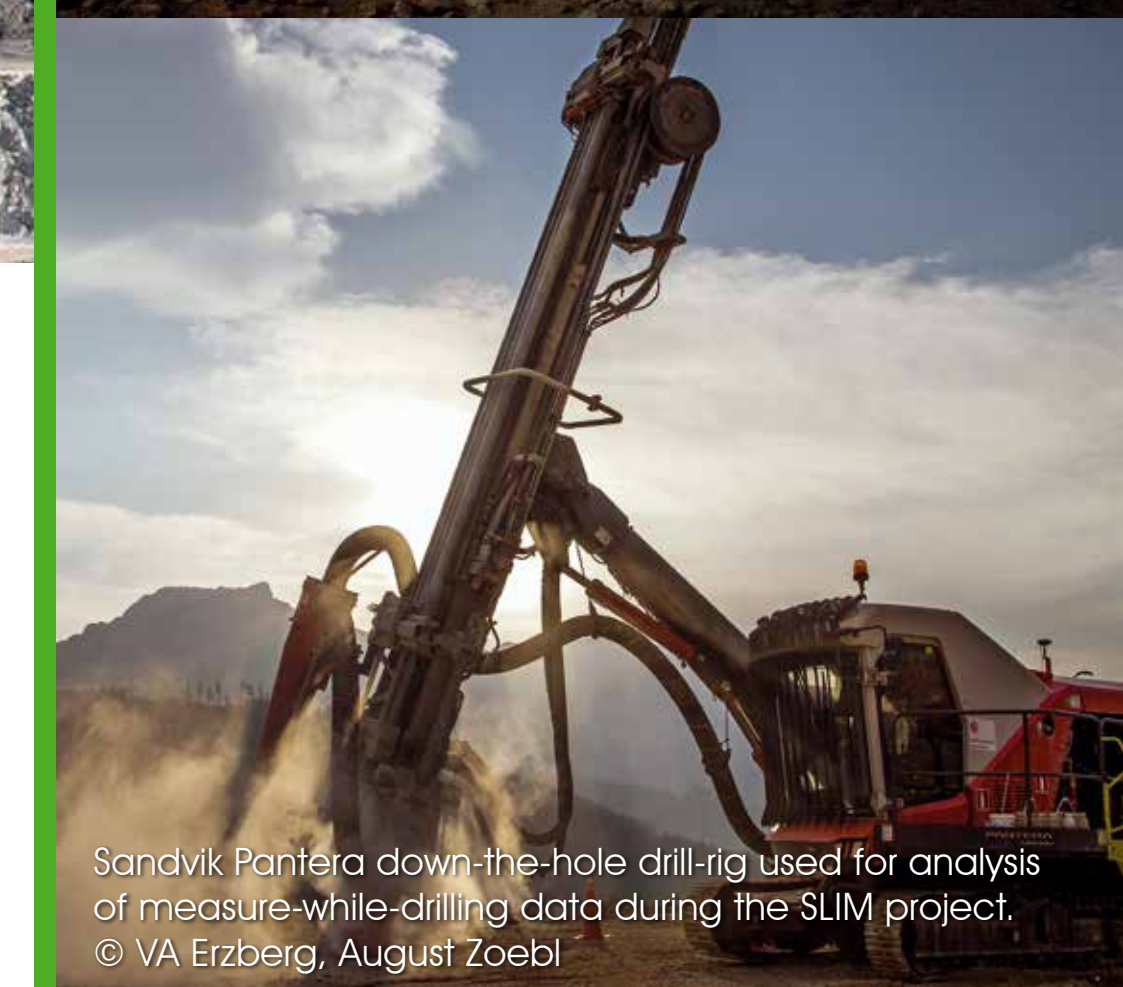
Sandvik Pantera down-the-hole drill-rig used for analysis of measure-while-drilling data during the SLIM project.