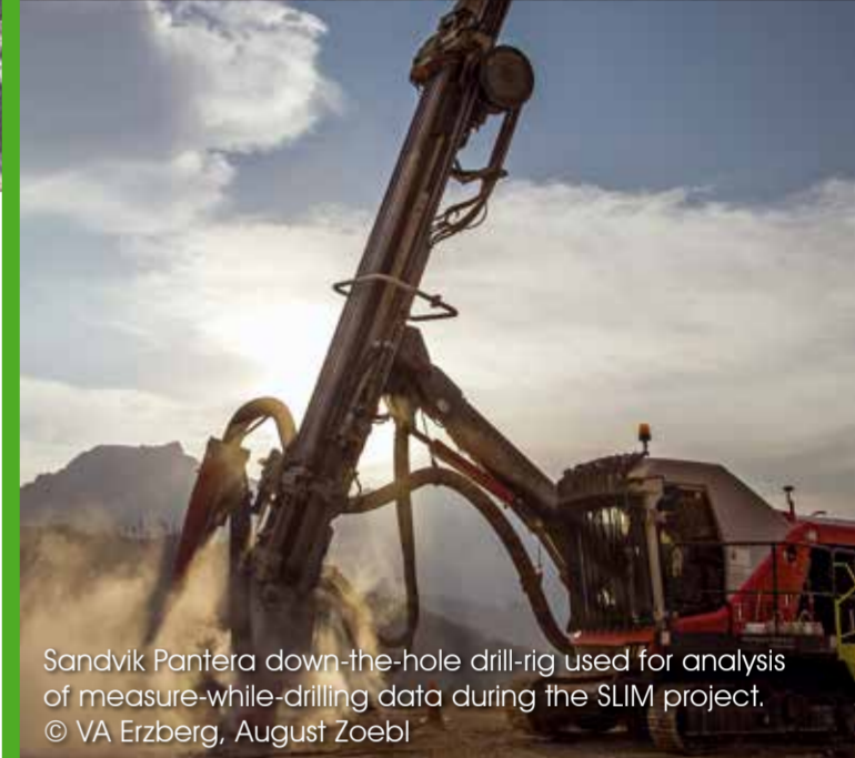
Sandvik Pantera down-the-hole drill-rig used for analysis of measure-while-drilling data during the SLIM project.