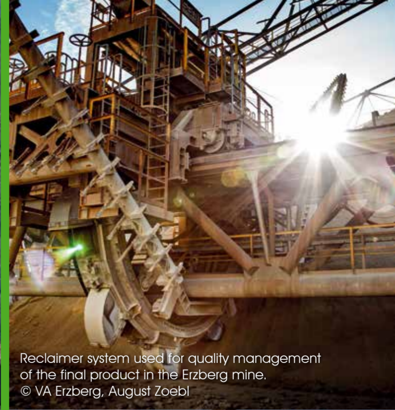
Reclaimer system used for quality management of the final product in the Erzberg mine.